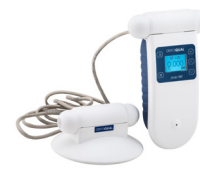
Remote Sensor Kit AS R10