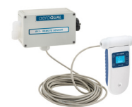
IP41 Remote Sensor Kit AS R13