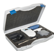
Carry Case Small AS R40