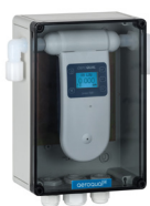
Industrial Enclosure HH ENC