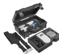
Carry Case Large AS R41