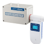
Calibration Kit AS R42